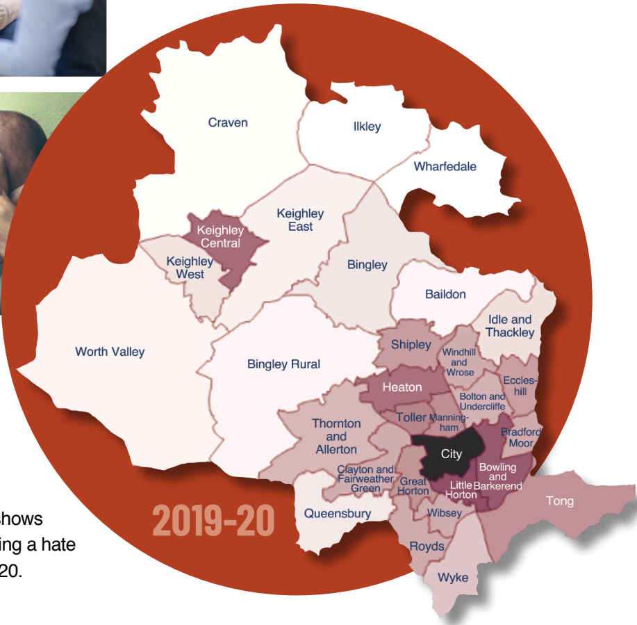
The map on the right shows central Bradford as being a hate crime hotspot in 2019-20.

A reporting pathway is the process by which victims will be signposted to the appropriate provider, which could involve guidance to the nearest reporting centre. This could involve use of technology to help the victim to report. Staff in centres that are reporting pathways will still be trained, however these centres will not be obligated to complete forms on behalf of victims or provide resources for reporting.